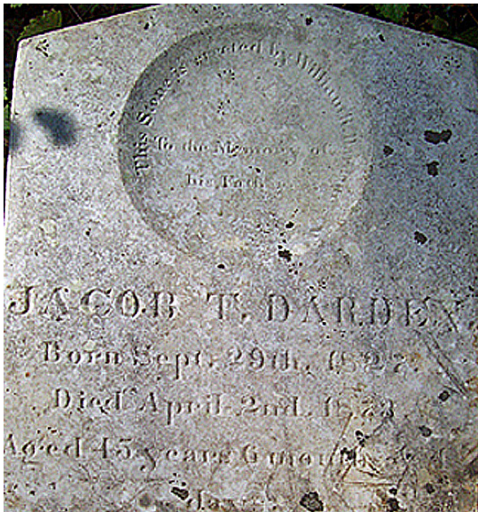
Old Shelby Iron Works Cemetery, Shelby, Shelby Co., AL